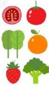
EAT VITAMIN C