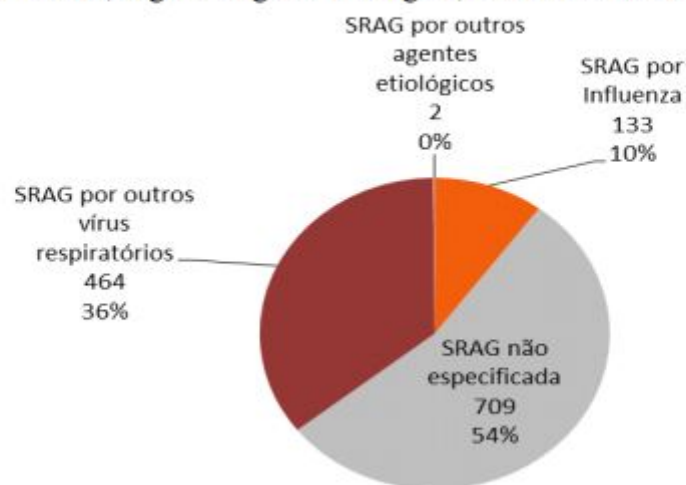
Gráfico 1 - Casos de SRAG, segundo agente etiológico, residentes no Paraná, 2019.

Atualizado em 28/05/2019, dados sujeitos a alterações.