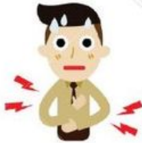
PAIN IN MUSCLES